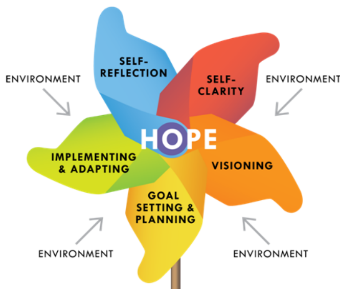
The Hope-Centered Model of Career Development

The HCCI is designed to be used in conjunction with the Hope-Centered Model of Career Development (HCMCD). Research shows that following direction of the arrows in the model is useful in planning and managing your career and life effectively.